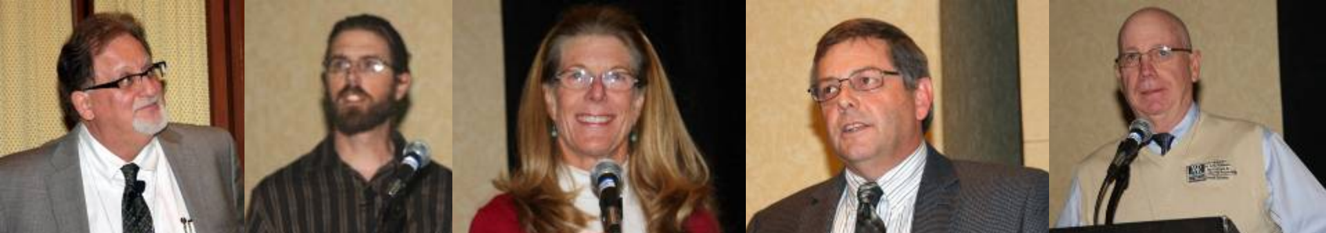
Weed School, General Session, Student Contests, Speakers, CWSS Directors, Moderators & Staff