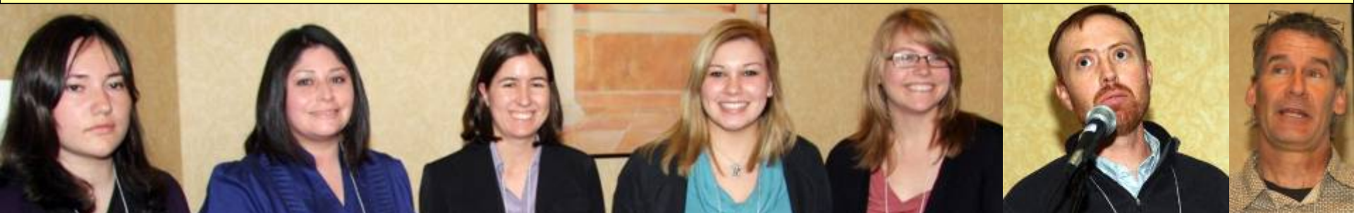
Weed School, General Session, Student Contests, Speakers, CWSS Directors, Moderators & Staff