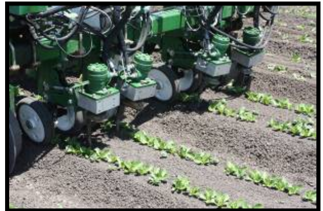
Rotating cultivator thinning lettuce