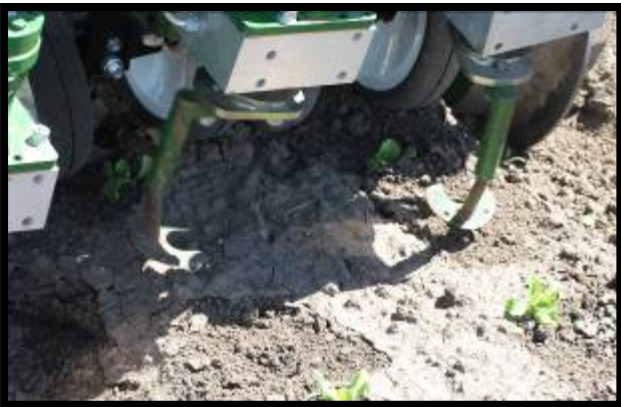
Rotating knives (not the notch that allows the blades to spin around a crop plant