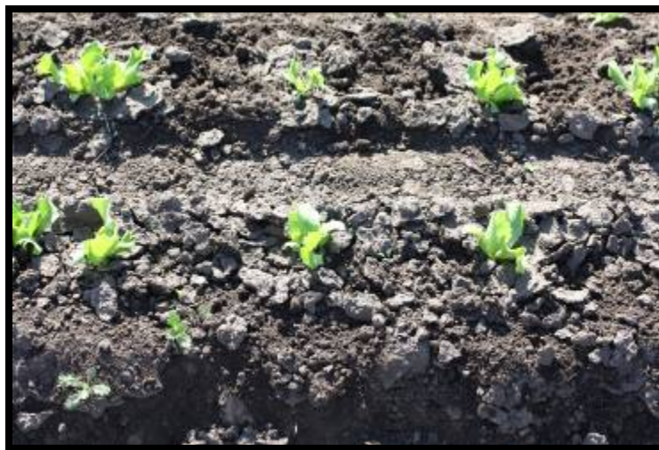
Lettuce stand following rotator