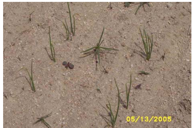
Onion at the 1 leaf stage infested with Russian thistle.

great care must be taken to ensure that herbicide application methods and timings are safe to onion. If onion plants do not have adequate tolerance to an herbicide treatment they can be stunted and delayed in their growth, resulting in yield loss. Onion yield was not measured from these treatments but needs to be evaluated in further test. However, since emerged onion is more tolerant of post emergence applications of Prowl, the onion loop stage is the most favorable stage for the application of Prowl.