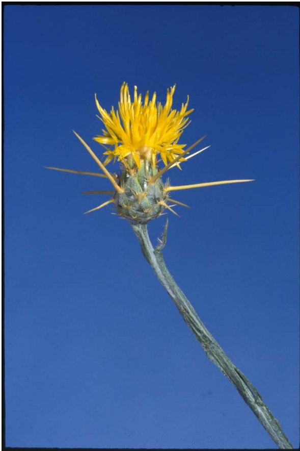
Yellow starthistle flower

Yellow starthistle (YST) is classified by the CDFA as a C-rated Noxious weed. All CDFA rated noxious weeds are considered to be highly damaging to agriculture and/or important native species. A “C” rating, as opposed to an “A” or “B” is given based on the widespread distribution (not impact) of YST and the impossibility of statewide or even large-region eradication. The California Invasive Plant Council (Cal IPC) rates YST as HIGH in ecological impact. Refer to ( http://portal.cal-ipc.org/files/PAFs/Centaurea%20solstitialis.pdf )